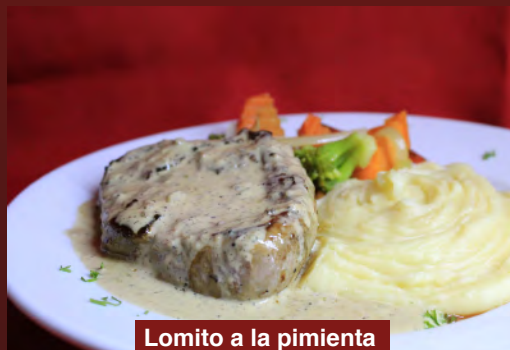
Lomito a la pimienta