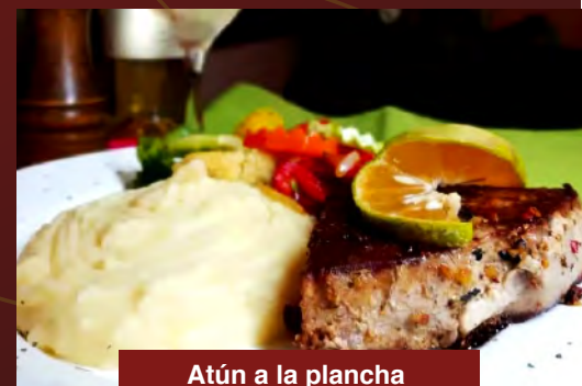
Atún a la plancha