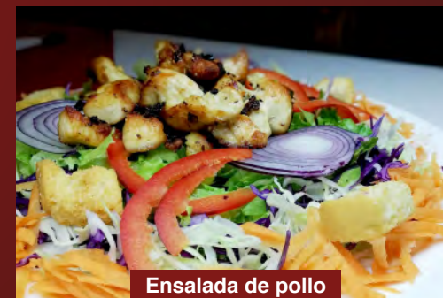
Ensalada de pollo