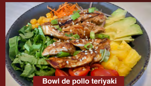
Bowl de pollo teriyaki