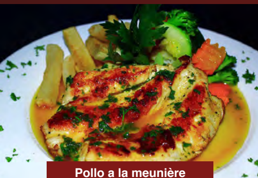
Pollo a la meunière

Breaded chicken breast filled with mozzarella cheese and ham, in mushroom sauce