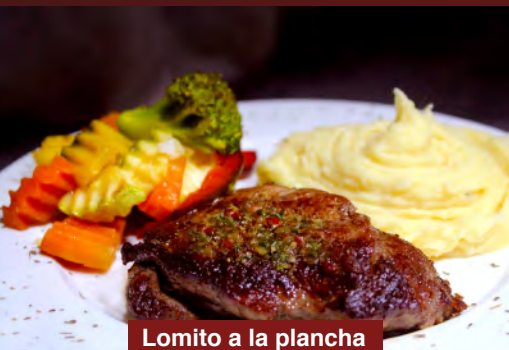
Lomito a la plancha