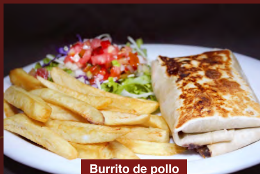
Burrito de pollo